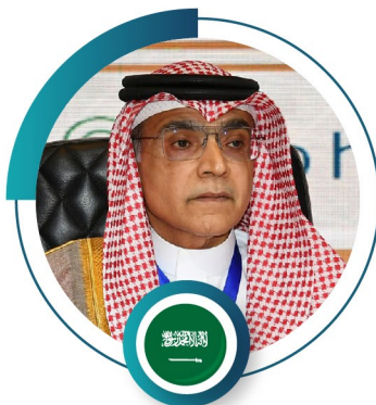
H.E. ABDULLAH SALEH KAMEL President